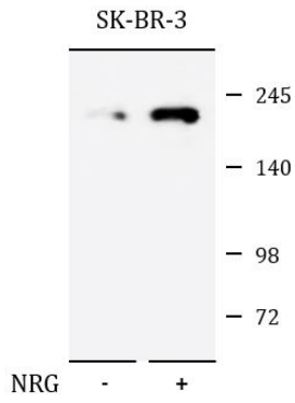
ARG54979 anti-ERBB2 / HER2 phospho (Tyr1140) antibody WB image

Western blot: SK-BR-3 cells untreated or treated with NRG and stained with ARG54979 anti-ERBB2 / HER2 phospho (Tyr1140) antibody.